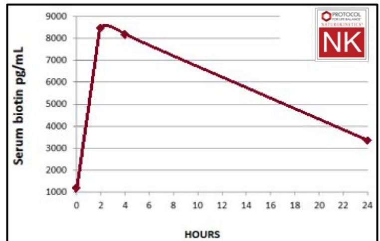
Fig. 2. Average serum biotin levels before, 2, 4 and 24 hours following a single administration of one capsule of Biotin 5,000 mcg (Protocol For Life Balance®, Bloomingdale, IL; Product # P0471) in healthy adult volunteers.